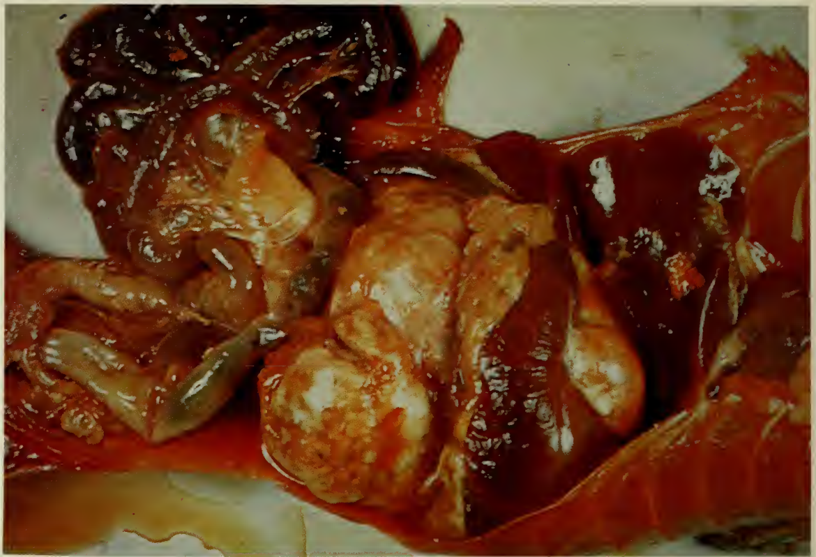
Fig. 3. Tuberculosis — lesions in abdominal organs.